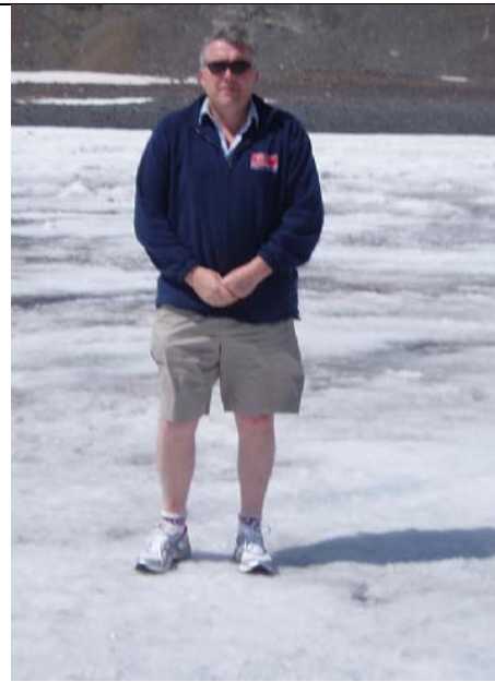
Glacial Floe, near Jasper

A vast area of outstanding natural beauty