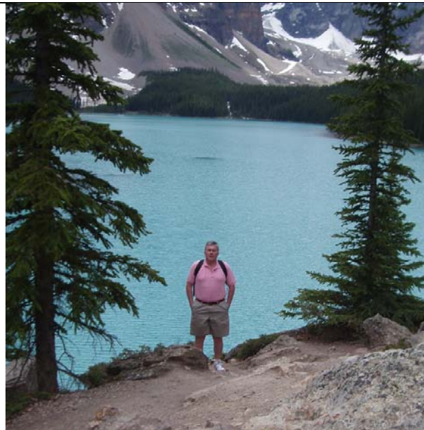
Moraine Lake, Banff

I never realised that running at altitude was so difficult. I felt completely unfit. I felt horribly over weight. I felt very slow. A few short miles felt like a marathon and more. I cannot now wait to get back home when, no doubt, the same feelings will be experienced but I will have no excuses. Below are a couple of holiday snaps.