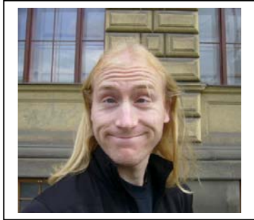
Just what has he eaten?