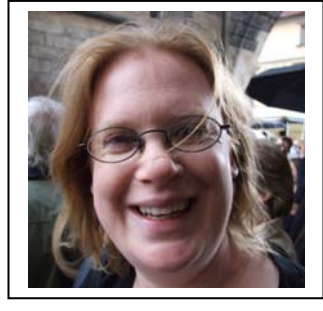
What has she been drinking?