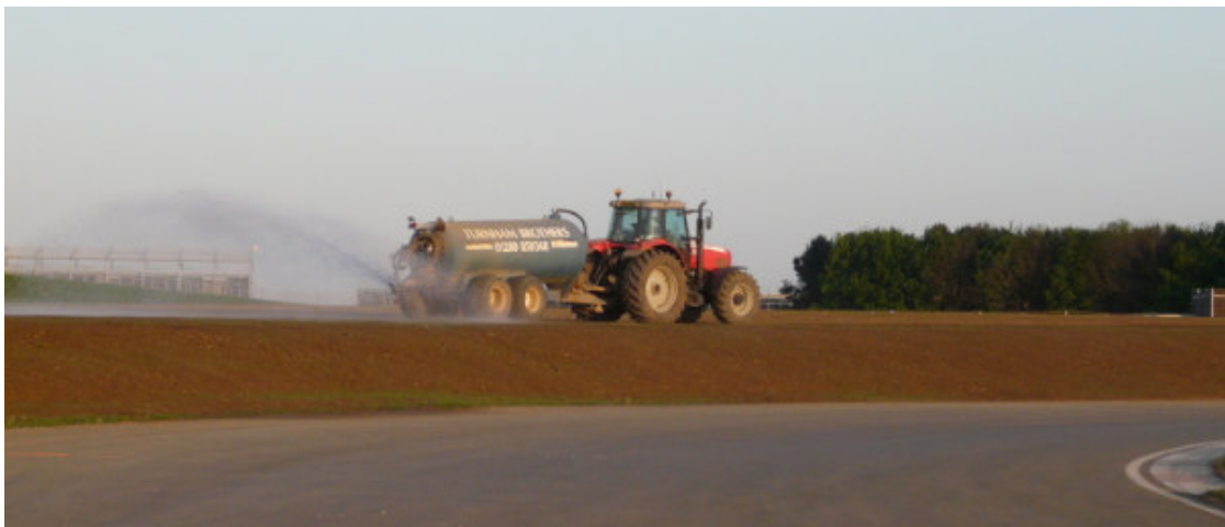
Silverstone Circuit practice for the showers for the runners next Wednesday