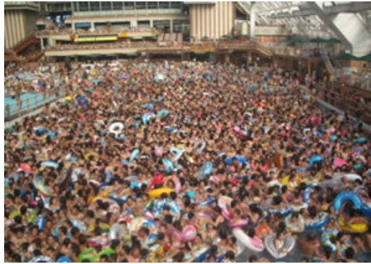
Bloody half term