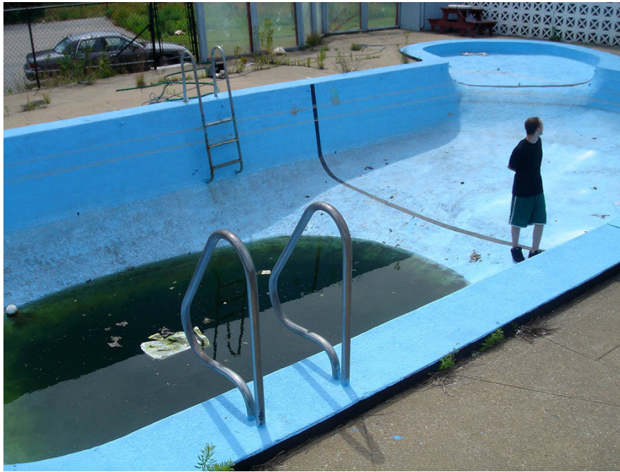
Total fitness is just a few lengths away.....

It's injury time again, so I've been hitting the pool to get some quality cross-training done. In reality, this means trudging blurry-eyed to the pool for a pre-work swim, and then emerging with red blurry eyes and a goggle marked face to fill a now ravenous belly with whatever the vending machine has on offer.