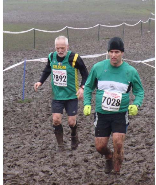
"Where's his foot gone?"