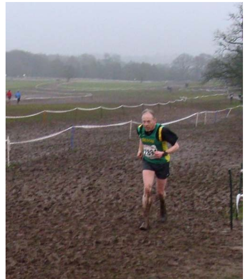
The Comeback Kid