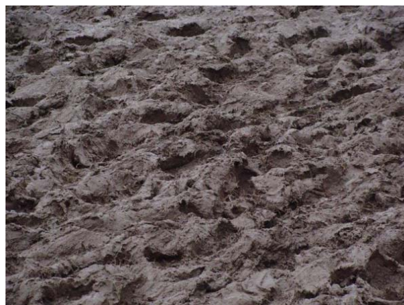
See more memories of Alton Towers overleaf